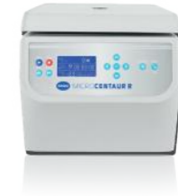
MICRO CENTAUR P

The Kestrel is a small compact non-refrigerated benchtop centrifuge capable of spinning 6 blood tubes at over 3000g. Reliable, compact and easy to use, the Kestrel centrifuge is the perfect addition to any medical environment where a small number of blood tubes need to be processed quickly and efficiently.